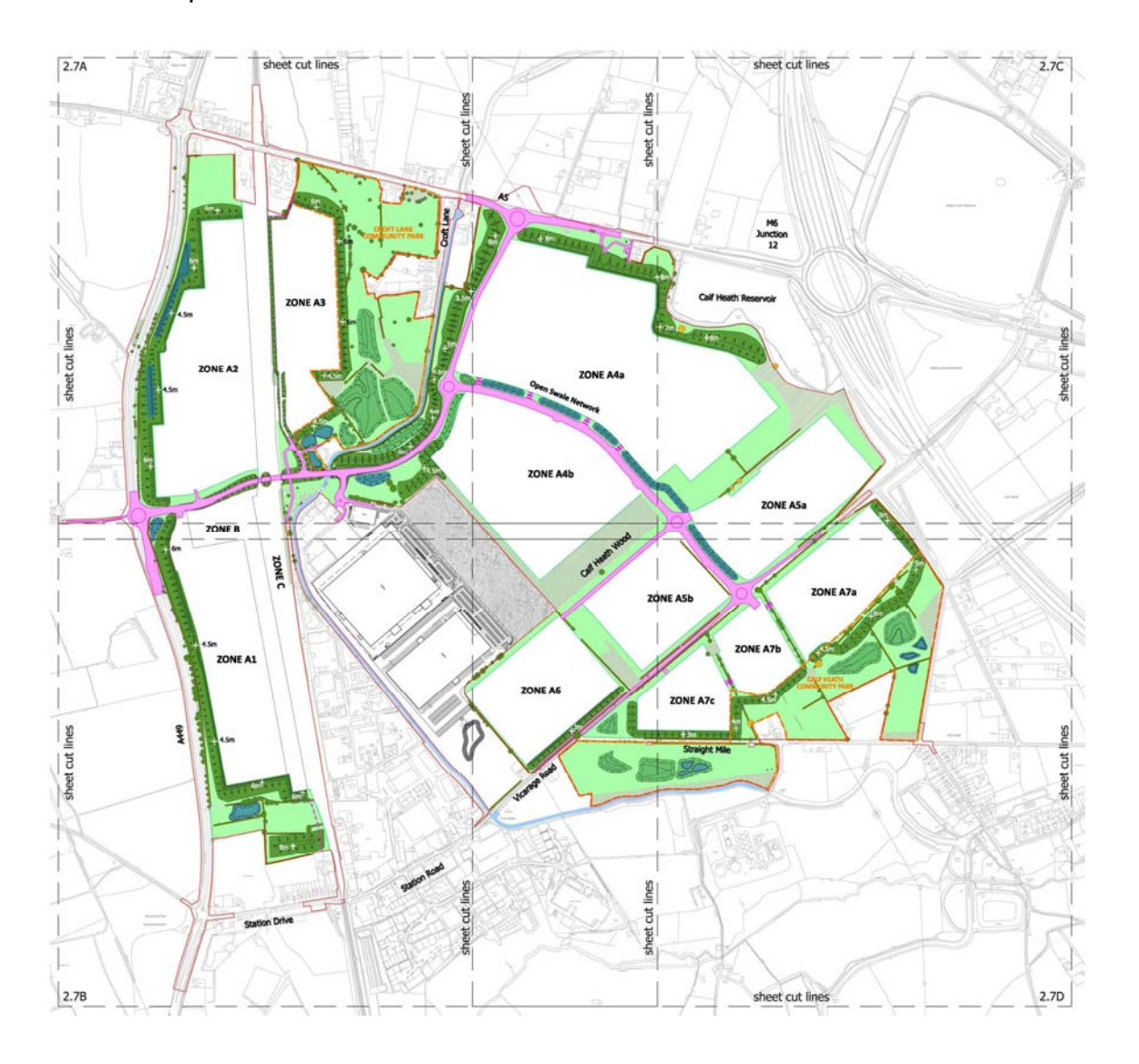
Figure 3 – Green Infrastructure Parameters Plan

4.4.4 The landscape and GI areas will extend to approximately 107 ha (approximately 36% of the Site area) and will include the creation and conservation of landscape corridors throughout the Proposed Development; the provision of new mixed habitats to satisfy biodiversity objectives; the formation and planting of earthwork bunds around the perimeter of the Site.